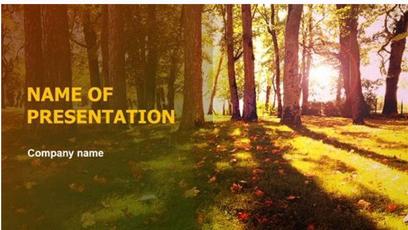
Microsoft office 2008 mac crack download. 2008 macbook pro price. Microsoft office 2008 for mac free download full version crack.